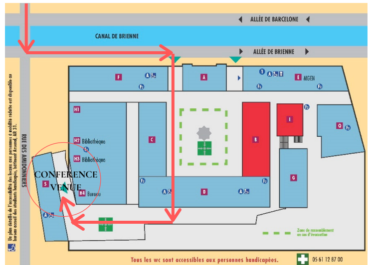
Auditorium MSoor at the Manufacture des tabacs